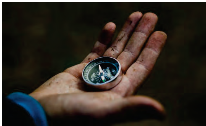
The RWLT Board has identified strategic priorities to guide activity over the next few years.

We can now move forward with confidence, starting with a review of RWLT's goals and how to achieve them. The Board has mapped out its strategic priorities, focussing on five: Board Development, Finances, Staff, Property Management and Communications. More detailed information on each aspect is available on our website. This list will also be helpful to RWLT supporters and volunteers who may wish to help with a particular aspect of the Trust's operations.