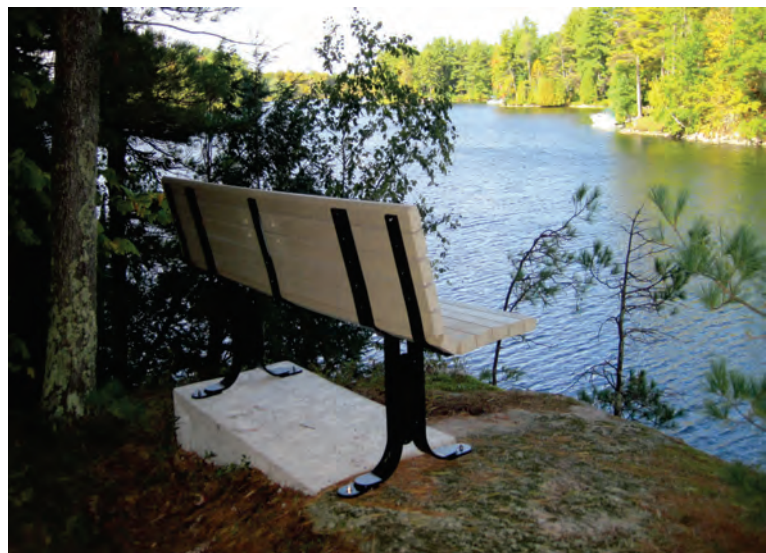
New memorial bench on Morton Bay Loop at Rock Dunder, provided by a generous donation.