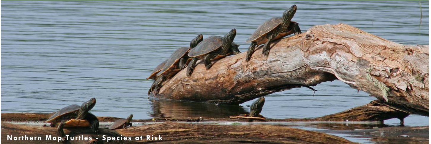
Northern Map Turtles - Species at Risk