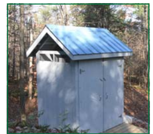
New Comfort Station